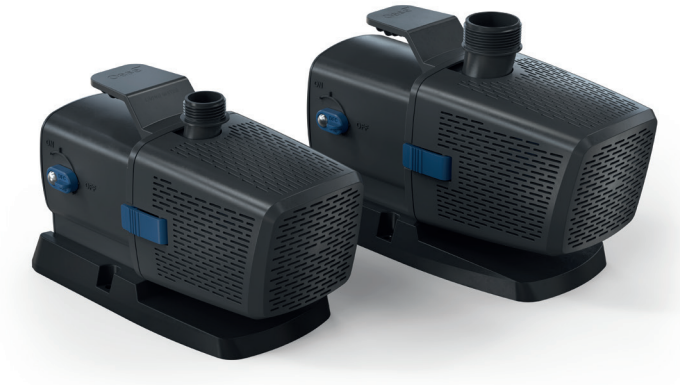
Aquarius Eco Premium 1700 & 3700

Versatility of running submersed or inline, and in fresh, salt and chlorine water makes this pump the perfect choice for a wide range of applications.